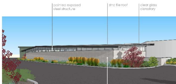
Concept Sketch – final project design may differ

and north of Voigt Drive and west of Greenhouse Lane proposes a single-story building enclosure which includes enhancements to university energy systems by increasing electrical system reliability and efficiency while simultaneously providing uninterrupted power in the case of an emergency or catastrophic event. The proposed project replaces existing landscape and removes 9 parking spaces, simultaneously reconfiguring the parking lot and adding permeable pavement and new storm water improvements.