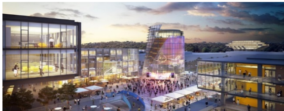
Concept Sketch – final project design may differ

The Triton Pavilion located in the heart of campus, fronting on Gilman Drive and in close walkable distance from the future