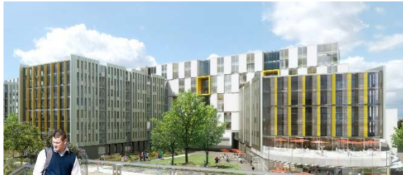
Concept Sketch – final project design may differ

Pepper Canyon West Housing located in Pepper Canyon on the west campus and adjacent to the future Light Rail Transit